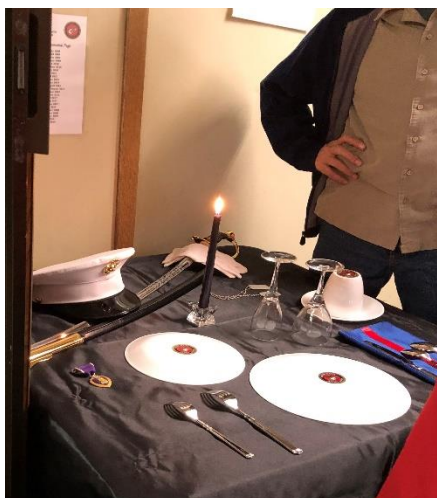
Missing Man Table...