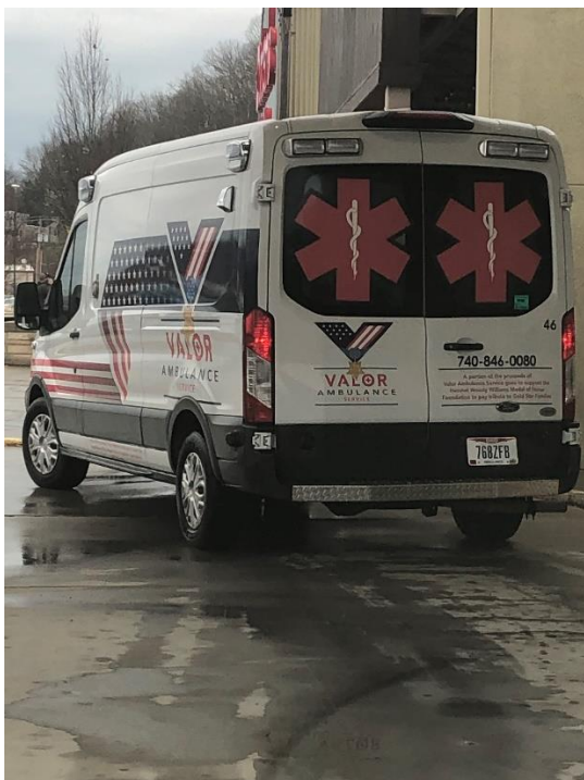
A portion of the proceeds from services provided by this medical transportation company is donated to The Hershel Woody Williams MOH Foundation