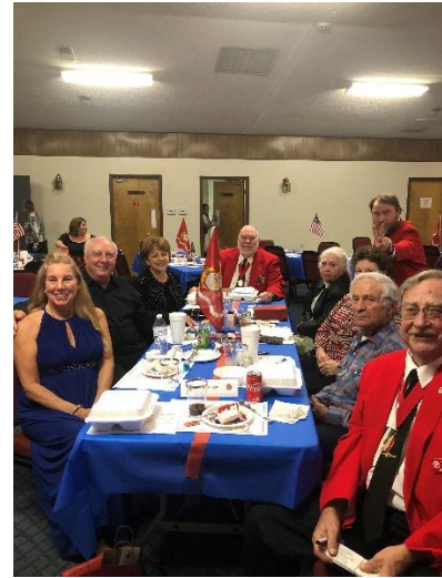
245 th Birthday Ball Celebration, members and guests of Huntington Det 340