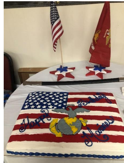
Marine Corps 245 th Birthday